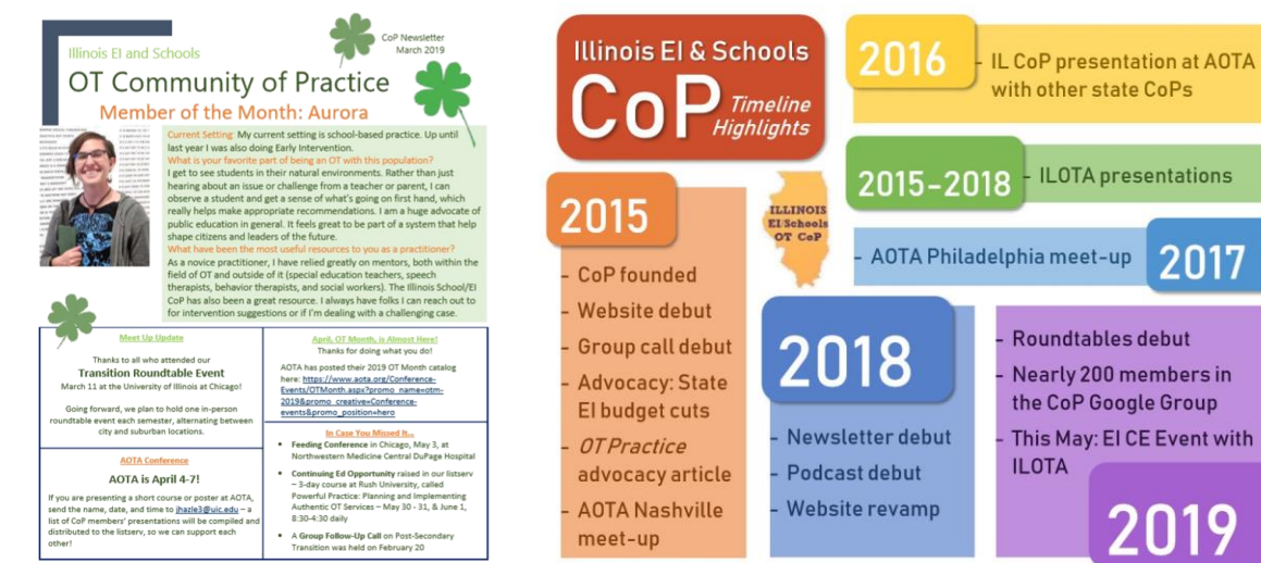
Figure 3. New site content: newsletters and a timeline.